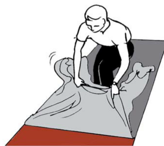
2. Remove backing carefully before turning GamFloor™ over.

With the backing side up, start to peel the backing sheet off. One person holds one end of the cut section of the GAMFLOOR sheet, the second person carefully peels away the backing material and discards. See Figure 2. Once the backing is removed, turn the GAMFLOOR over. This requires two installers at either end of the cut material grasping the four corners of the sheet. Carefully turn over holding one edge up. Be careful not to stick GAMFLOOR to itself, should this occur, you can separate the low-tack adhesive.