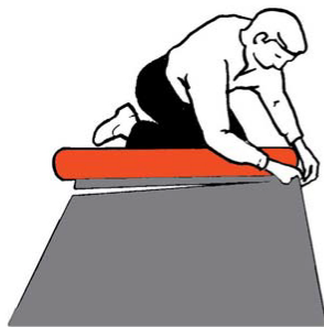
1. Roll out GamFloor™ and trim to fit with backing side up

Easy to install on a clean surface, it does require two or more people to handle the 48-inch wide material. With its backing still in place, roll out GAMFLOOR in the area you wish to place it. Cut to the overall length required. See Figure 1.