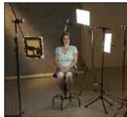
LitePads being used on set