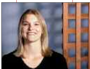
OPAL TOUGH FROST

Shown above are subtle but significant results you can achieve with Rosco diffusion materials. The model, set and film are the same in each photo, only the Rosco diffusion materials were changed. Note: diffusion results will vary when the diffusion material is affixed at the source vs in a frame placed at a distance in front of the source