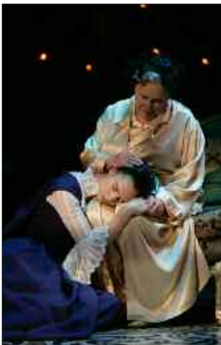
Stanley: Dangerous Liaisons