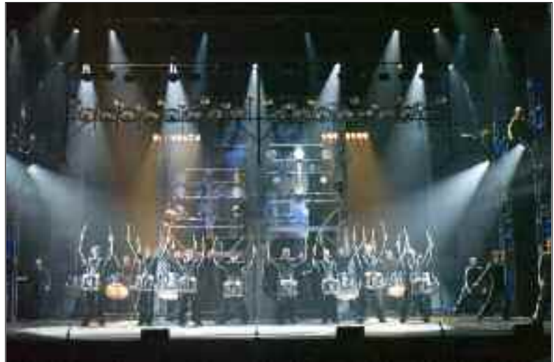
Baldassari: Blast II