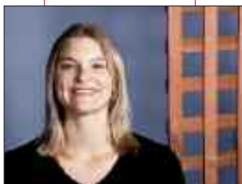
1/4 TOUGH WHITE