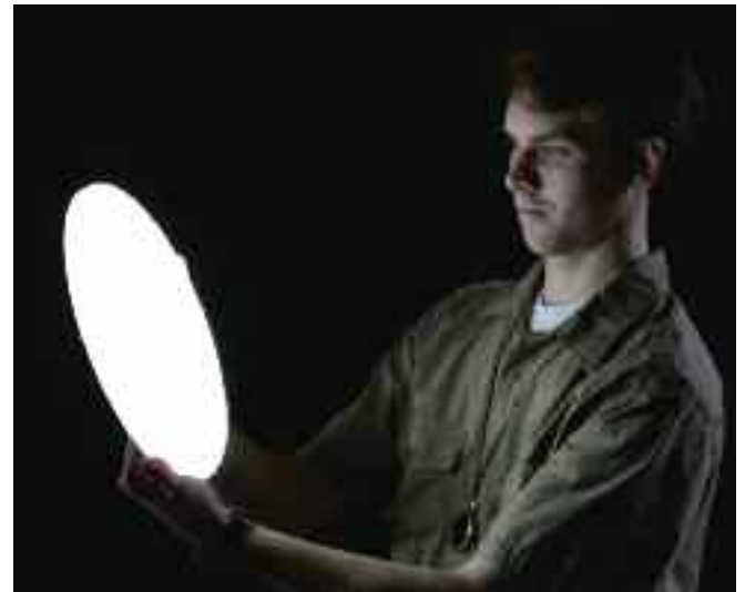
LitePad HO is now available in eight standard sizes, including a 305mm circle, shown here.