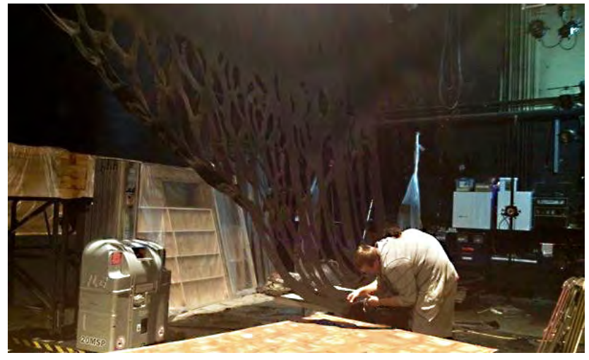
Scenic Artist, Gregory Pinsoneault, cuts the design into the duvetyne drop

Since the duvetyne was much thinner than velour I needed to find a way to stiffen the fabric so that the image wouldn't sag once we cut into the drop. The design of the cut sections was well thought out though, so instead of using scenery netting on each little hole, we decided to spray the back of the drop with CrystalGel to stiffen it.