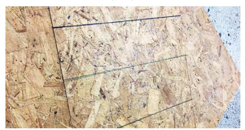
OSB Sample Boards coated in CrystalGel

For a production of Little Bunny Foo Foo at Actors Theatre of Louisville, our scenic designer, Laura Jellinek, imagined a series of OSB geometric mounds across the stage. The production called for both the adult & child actors to climb and slide all over the set, so the paint shop was tasked with figuring out how to make the OSB a safe, splinter-free surface.