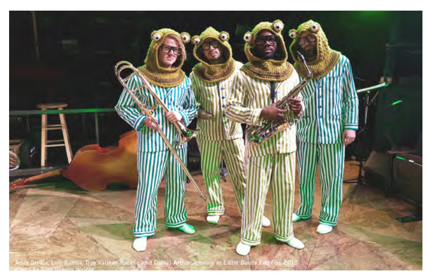
Sock-clad Gentlemen Toads in Little Bunny Foo Foo at Actors Theatre of Louisville Scenic Design by Laura Jellinek

For a production of Little Bunny Foo Foo at Actors Theatre of Louisville, our scenic designer, Laura Jellinek, imagined a series of OSB geometric mounds across the stage. The production called for both the adult & child actors to climb and slide all over the set, so the paint shop was tasked with figuring out how to make the OSB a safe, splinter-free surface.