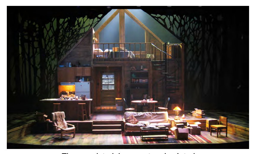
The completed drop - cut and painted

I was lucky to be working in a large fly-house at the time, so we were able to hang the curtain on a batten (along with a ton of plastic masking!) and spray it in the air. Because CrystalGel is easily watered down I was able to thin it out enough to pass through an airless sprayer and apply multiple thin coats until I was happy with the stiffness of the "faux-velour."